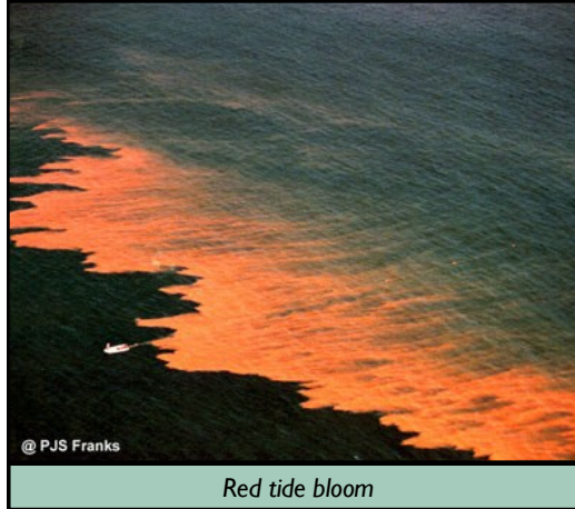
Red tide bloom

Hundreds of stakeholders spent over two years working together through public workshops and forums to create the residential fertilizer and landscape ordinance that was put in