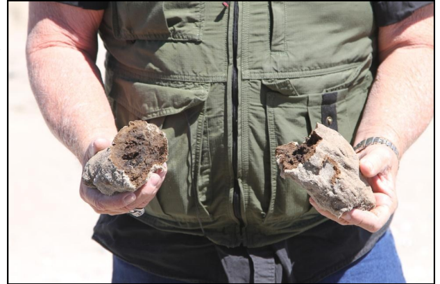
At many locations along Fourchon Beach, these "oil geodes" litter the beach every few feet.

Our new Assistant Director of Science and Water Policy will oversee the GRN's environmental protection priorities in the state of Mississippi,