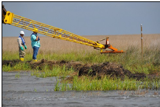
A marsh rake removes black, oil-caked stems as well as some marsh roots as collateral damage.

Although the island has been losing an average of 46 feet of shoreline a year, the beaten barrier beach continues to protect us. Because of the BP drilling disaster, barrier island restoration projects have been delayed—costing us time and money that we don't have.