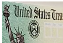
Homeowners Are In For A Big Surprise... Smart Life Weekly