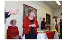
Lumberton's Centennial Committee