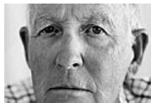
'Warren Buffett Indicator' Signals Coll... Moneynews