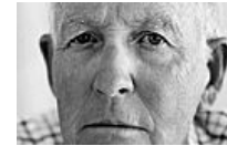
'Warren Buffett Indicator' Signals Co... Moneynews