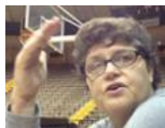
Clemons rebounds after rough start to season (1m27s)