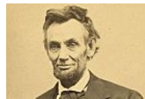
You Won't Believe Who's Related to Abr... Ancestry.com