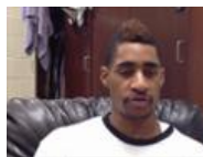
USM's star guards (2m10s)