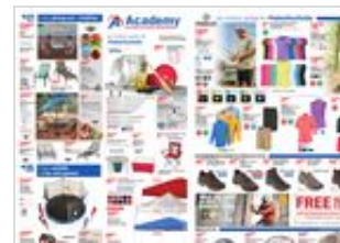
ACADEMY SPORTS + VALID UNTIL APR 26