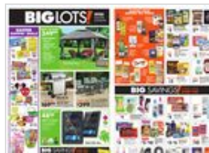
BIG LOTS EXPIRES THIS SUNDAY