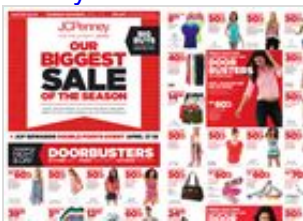
JCPENNEY 2 DAYS LEFT