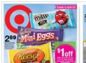
TARGET 2 DAYS LEFT