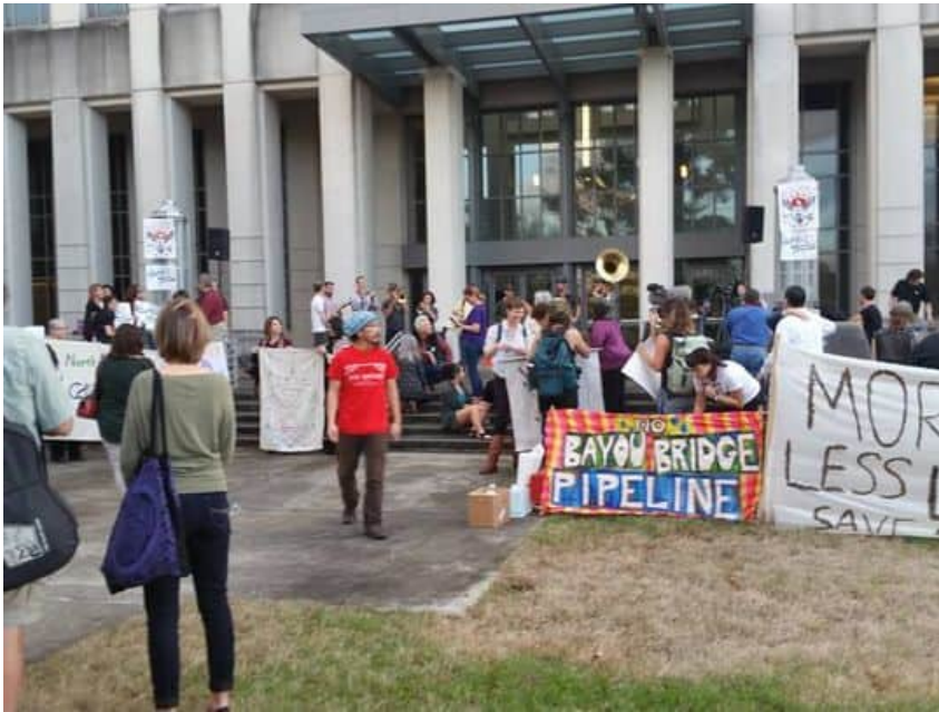
A protest outside of the public hearing in Baton Rouge about the Bayou Bridge Pipeline.

"No mention is made regarding how neighboring residents would benefit from the proposed project," the letter said. "The proposed pipeline presents the following imbalanced interests: on the one hand, unidentified and uncertain economic gain; and on the other hand, the concrete and quantifiable risks to human health and safety and destruction of wetlands."