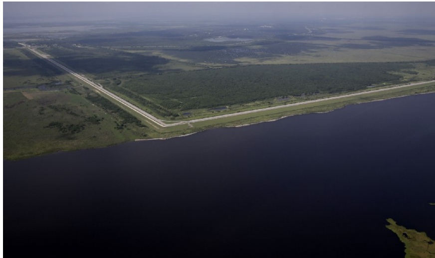
Aerial view of St. Bernard Parish, Louisiana.

Foster Campbell is a rare voice in Louisiana politics because he talks about climate change—a lot.