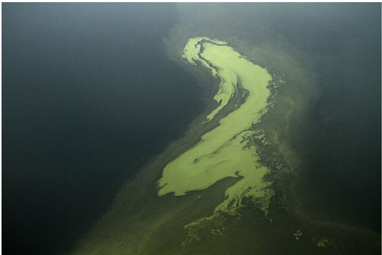
Figure 2. West Lake Pontchartrain algal bloom, December 14th, 2017, south of the mouth of the Tchefuncte, St Tammany Parish. Winter algae blooms are a rare phenomenon, likely spurred by the runoff from floodprone residential areas such as the one proposed by the applicant.

The fill of such a large area itself is in violation of the federal and state anti-degradation policy for the scenic Tchefuncte River. When we consider the hundreds of acres that have been permitted to be removed from this area in the last 5 years, water quality in Lake Pontchartrain is affected. Since the storms of 2016, the Lake is very prone to algal blooms from the residential pollution that washed into the lake after those large rains.