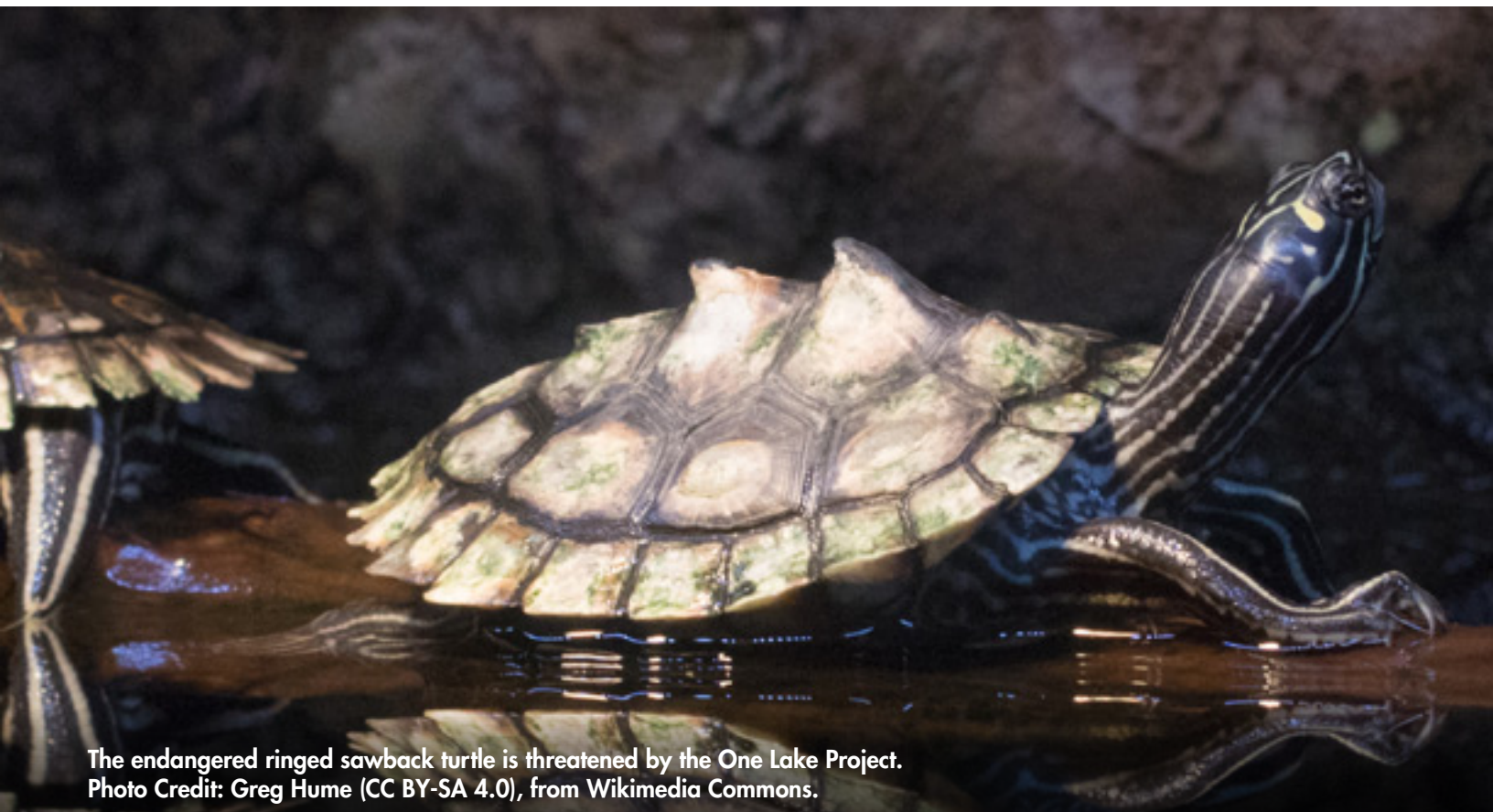
The endangered ringed sawback turtle is threatened by the One Lake Project.

GRN will continue to defend the Pearl and everyone who lives along its watershed until the One Lake project is defeated. To learn more and join the fight, visit onerivernolake.com .