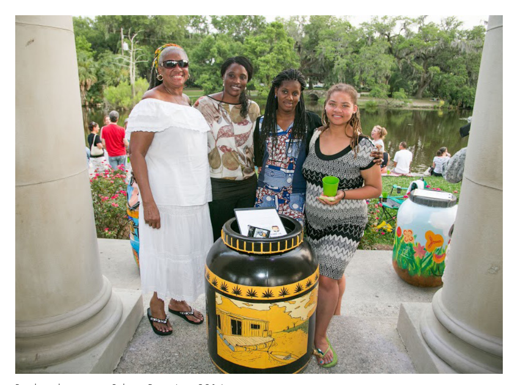
Rainbarrel auction at Solstice Party, June 2014.

Twenty years since our founding, GRN is still committed to uniting and empowering people to protect and restore the natural resources of the Gulf Region. In 2014, GRN collaboratively organized across the Gulf - we joined with thousands across the nation for Hands Across the Sand events in FL, MS & LA, we celebrated our 20th year with partner organizations at a Summer Solstice party in New Orleans' City Park, and partnered with the Gulf Future Coalition to host the sixth Gulf Gathering. We are grateful and excited to continue our important work organizing, advocating, monitoring, and collaborating in the interest of protecting and restoring the Gulf