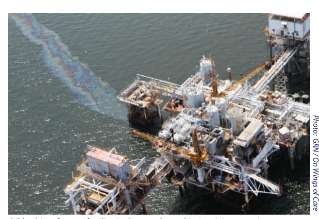
Oil leaking from a facility in Breton Sound in Louisiana on August 19,

BP's remaining oil underscores the need for action to ensure we protect and restore the Gulf. GRN continues to advocate for the creation of a Gulf Regional Citizens Advisory Council to increase transparency and community accountability from the oil industry as they operate in the Gulf. A positive step was taken recently with the passage of the RESTORE Act through committee in the Senate and introduction in the House. This legislation would direct 80% of the fines collected from BP to the restoration of the Gulf's ecosystem and coastal economies. The fines could possibly top $20 billion, creating a significant opportunity for Gulf recovery. GRN will be turning to our members in the weeks ahead to mobilize a unified voice in support of improving the bill and passing it into a law.