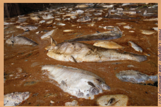
Dead fish in the Pearl River from Temple-Inland's pollution discharge, August 19, 2011.

A discharge of "black liquor" and other pollutants from the Temple-Inland paper mill in Bogalusa, LA caused a massive fish kill in the Pearl River this August.