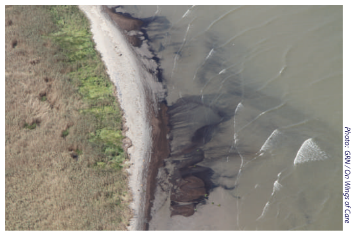
Oil on the beach of East Bay, LA after Tropical Storm Irene.