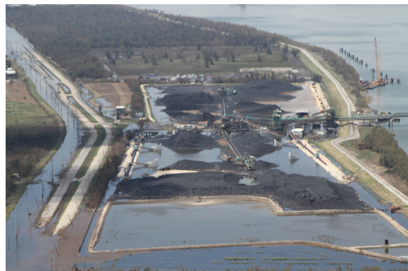
Runoff from the flooded Kinder Morgan coal terminal pollutes surrounding waters, wetlands, and farmlands.