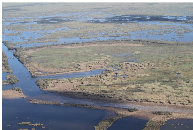
Bayou Dupont marsh creation project. Efforts such as these can be scaled up once RESTORE Act resources are directed to Gulf coast restoration efforts.

In an unusual bipartisan victory this July, the RESTORE Act, which dedicates BP's Clean Water Act fines to Gulf restoration, was included in the Transportation Bill that passed Congress, and was signed by the President! GRN, our allies in Congress, and other environmental groups worked hard to make this a reality, but this wouldn't have been possible without you. Thank you for all your phone calls, emails, donations, and all you've done to prioritize the Gulf.