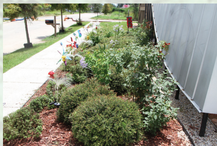
A rain garden in the Lower 9th Ward.

In August, GRN and our partner Bayou Interfaith Shared Community Organizing (BISCO) hosted a forum in Terrebonne Parish to discuss the state government's dedication of significant future funding for flood-resistant development measures such as elevation of homes, flood-proofing, voluntary acquisitions or buy outs of flood-prone areas, and community relocation. We look forward to hosting more of these discussions.