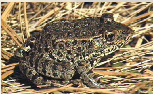
Mississippi gopher frog: One of the proposed sewage treatment plants would be located next to the only known wild breeding site for the Mississippi gopher frog.

infrastructure in the coastal counties. Since then, GRN and our allies have been fighting these projects due to concerns over their impacts on wetlands, water quality, and endangered species.