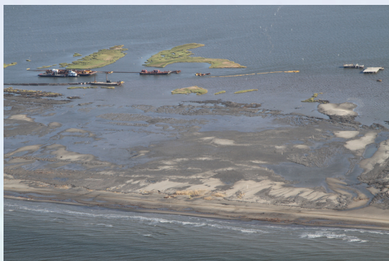
Rebuilding a barrier island, one of our coastal lines of defense, to protect communities and wetlands. RESTORE Act dollars can fund more projects like this.

So, take a moment to relish this hard-fought victory. Together, we pushed DC to support the Gulf! That's impressive, and that's why your efforts are so important to us.