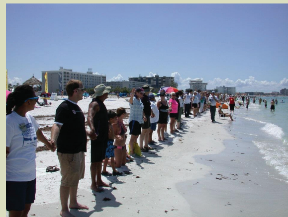
Over 350 people came out to say no to oil drilling and yes to clean energy and clean water at St. Pete Beach, Florida.

This August, GRN joined the world-wide Hands Across the Sand movement to protect our coasts from oil drilling by organizing events in Louisiana, Mississippi, and Florida.