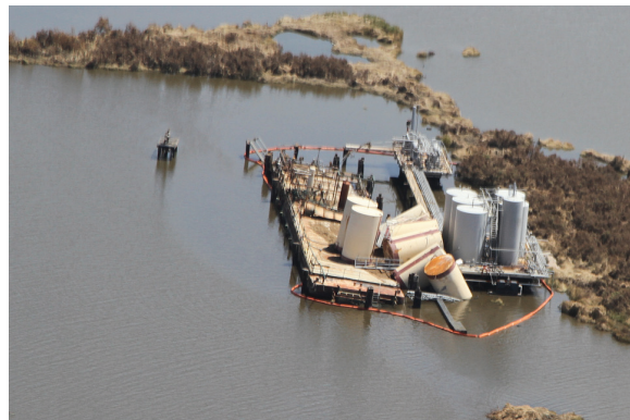
Damaged oil infrastructure near Myrtle Grove, LA leaking oil into the water.