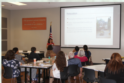
Forum in Terrebonne Parish to discuss flood-resistant development.

Louisiana is soliciting input on how to best use its resources to support coastal communities. Projects continue in New Orleans that will spend hundreds of millions on stormwater drainage projects. It is high time for all of us to figure out the best ways to live with water.