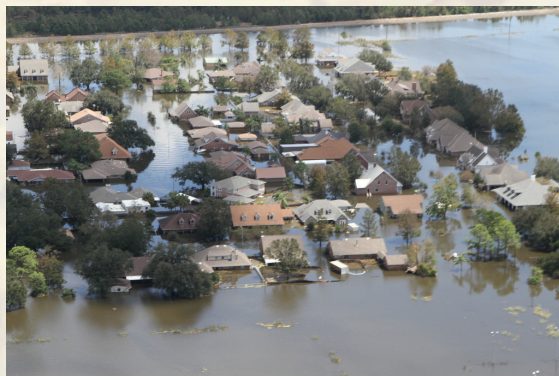
The community of Braithwaite, LA experienced devastating flooding from Hurricane Isaac's storm surge.

The short term (20 years or so) protection of vulnerable communities lies in the strategic restoration of coastal wetlands and the implementation of strategies - such as elevation of houses, comprehensive storm water management, green infrastructure, stringent building codes and the like - to reduce risk and increase community resilience.