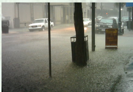
Street flooding outside GRN's office in New Orleans during a summer thunderstorm.

South Louisiana is faced with the ever increasing challenge of storms flooding our communities. In some coastal areas, even minor tropical storm systems result in major flooding problems that are expected to get worse over time due to sea-level rise and coastal erosion. In New Orleans, thunderstorms can give rise to flood waters thanks, in large part, to an antiquated and insufficient drainage system. As part of GRN's coastal lines of defense efforts, we are educating the public and leadership on ways to better live with water.