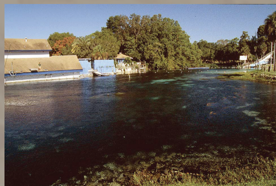
The beautiful Weeki Wachee Spring in Hernando County, FL.

Restoring wetlands, reducing water consumption, setting restorative minimum spring flows, and implementing a recovery strategy are all needed now to restore Weeki Wachee and other springs and keep freshwater flowing to the Gulf.