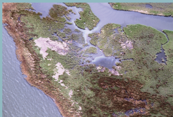
Oil and sheen are back in Bay Batiste, LA. September 10 th

GRN wishes a swift recovery to everyone impacted, and we’ll continue working to help restore a resilient Gulf.