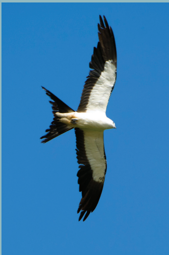
A swallow-tailed kite in flight.

The Swallow-tailed Kite, Elanoides forficatus , is a species that seeks out the largest blocks of connected forested wetlands in coastal Louisiana and Mississippi. It illustrates the need for places that are "big, wild and connected", a catch-phrase for conservation biologists like E.O. Wilson.