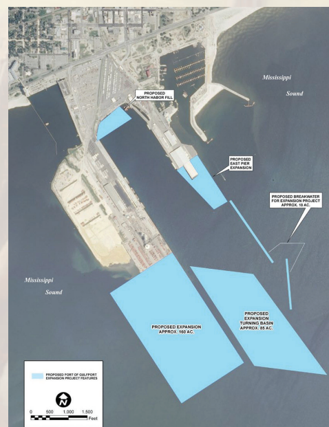
Proposed expansion plans for Port of Gulfport.

Governor Barbour and his friends moved aggressively after Katrina to funnel hundreds of millions of dollars in federal recovery funds meant for low-income housing into a massive expansion of the Port of Gulfport, and a slew of unneeded water and sewage