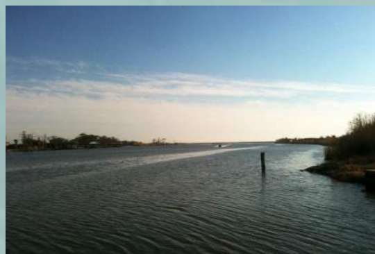
Pearl River at Highway 90 Bridge in Pearlinton.