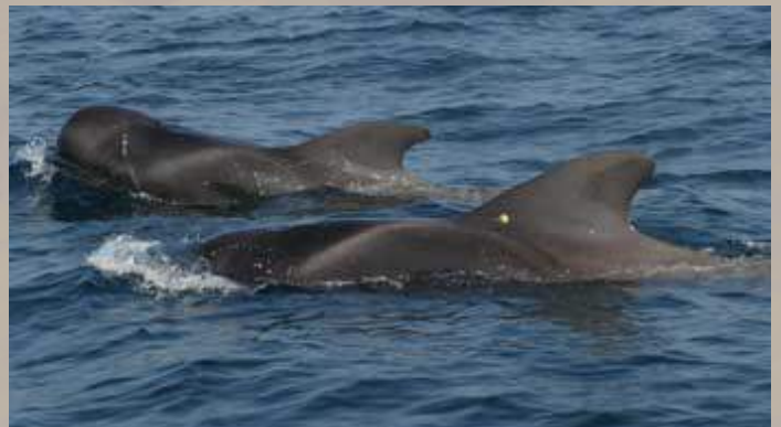
The short-finned pilot whale.

Rarely spotted at sea, the short-finned pilot whale lives in warm, tropical waters across the world. The short-finned pilot whale is part of the dolphin family and is the second largest species of dolphin after killer whales. This mammal has a bulbous "melon" head, no beak and can grow to lengths of 12-18 feet. Seldom found alone, short-finned pilot whales are social and generally found in pods of 10-30 animals. The short-finned pilot whales have earned a nickname as "cheetahs of the deep" for their high speed pursuits of a meal. The species tends to stay offshore, unless their main prey of squid is spawning, and the worldwide population is unknown. The short-finned pilot whale is not considered a threatened species on a global scale, but hunting, entanglement in fishing nets, noise pollution and capture for captivity are threats to this whale.