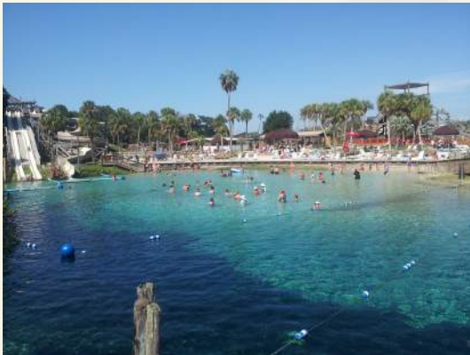
Weeki Wachee Headspring.

In November 2014, Sabal Trail filed an application with the Federal Energy Regulatory Commission (FERC) for authorization to construct and operate the pipeline. The Kiokee-Flint Group, Flint Riverkeeper, Georgia Chapter of the Sierra Club and Chattahoochee Riverkeeper, represented by Greenlaw, have taken the lead in efforts to raise environmental concerns about this destructive pipeline. GRN is supporting their efforts and is monitoring the process.