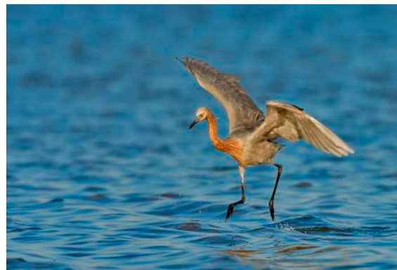
A reddish egret in Ft. Desoto, Florida.