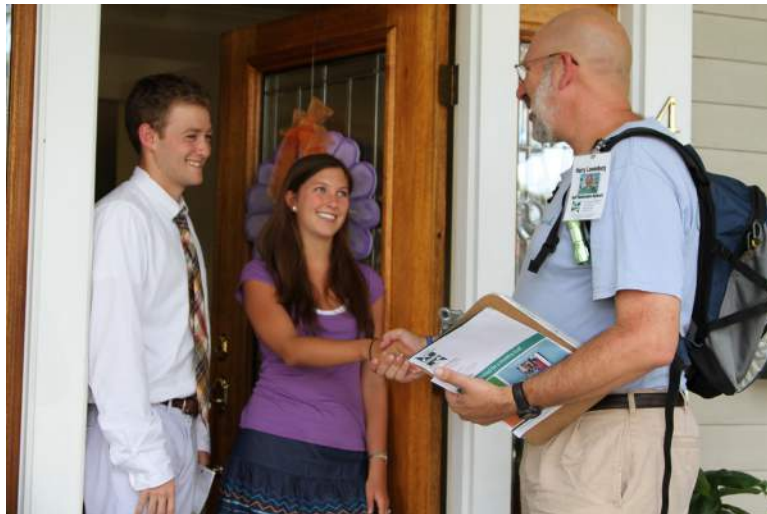
Don't forget to renew your membership!

Your ongoing support holds big oil & gas accountable, watchdogs restoration dollars and protects our most vulnerable Gulf communities. With 100 renewed members, we can amplify our work to reach more people and protect more waters and wetlands. Thank you so much for your past support and consider renewing your membership this fall.