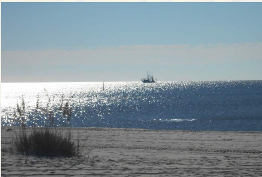
A fishing boat sailing along the coast of the Gulf of Mexico.