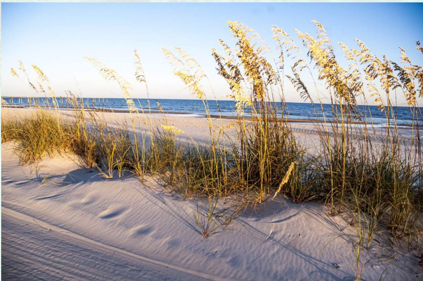
Sea oats growing along the Gulf Coast.

This is where the restoration begins. We cannot lose this momentum in building a resilient and sustainable environment and economy. As all the funds are dispersed, it is important for Gulf residents to hold Council-members accountable to ensure meaningful restoration for our communities and environment.