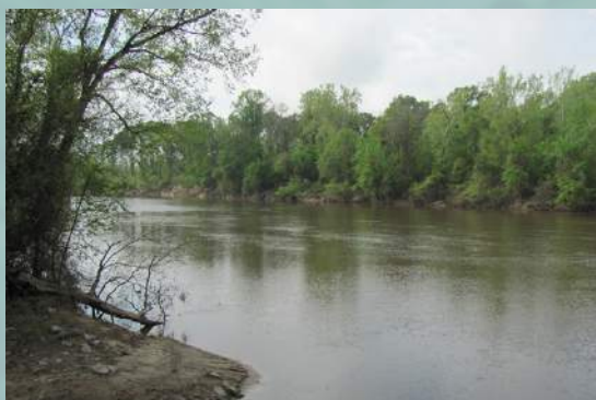
Pearl River landing at LeFleur's Bluff.

The Restore Council's Draft FPL includes a Gulf-wide project to measure, map and research trends in base-line fresh water flows from rivers draining to the Gulf, from Florida to Texas. The list includes a pilot project using one of Mississippi's large coastal rivers. Because the Pearl River has more threats to its flow than any other coastal river in the state, GRN hopes that the Pearl River will be chosen for this project.