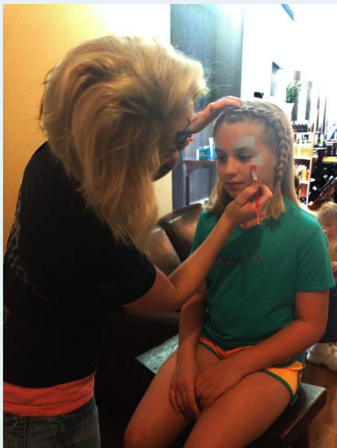
Face painting at the Tangerine Salon in Dallas, TX.

Thank you Aveda staff, students and clients, for an incredible Earth Month. You are protecting our rivers, streams, lakes and Gulf waters!