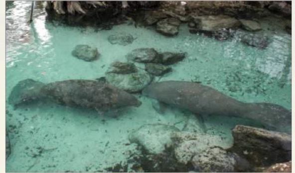
Two manatees in a Florida spring.

The company's preferred route will cut a large swath through significant stands of mature wetland hardwoods that are critical habitat for endangered and protected species like wood stork, bald eagle and cockaded woodpecker. This project will also require drilling which may negatively impact ecologically significant waterways.