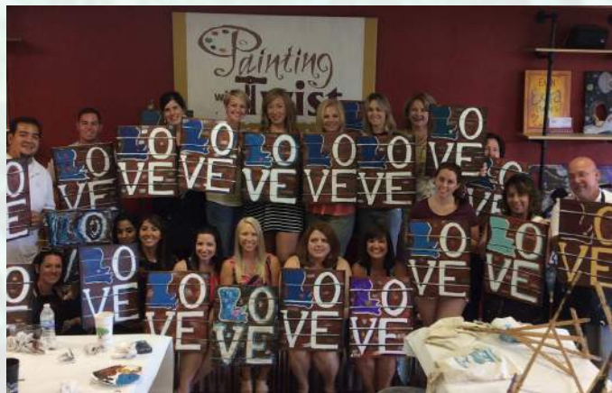
Salon Couvie and GRN; Painting with a Purpose.