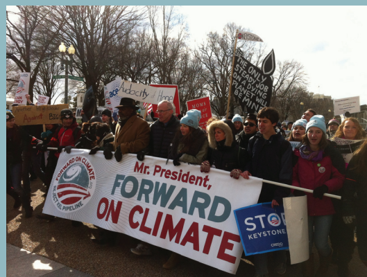
Demonstrators at the Forward On Climate Rally in Washington, D.C.