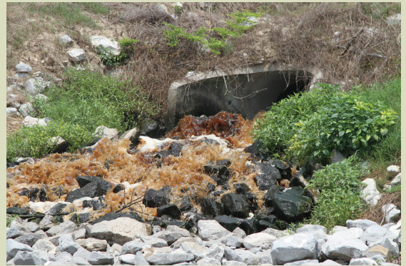
Outfall for the Hattiesburg South Sewage Lagoons.

If you have a sewage problem in your neck of the woods, check out GRN's publication Our Waters, Our Health: A Citizens' Guide to Sewage Pollution on the GRN website.