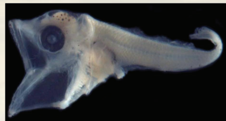
Bluefin Tuna in larval stage, this specimen is only 5 mm long.

The Gulf of Mexico is the only known spawning ground for the Western Atlantic bluefin tuna – a giant, warm blooded fish averaging 550 lbs and 6½ ft. in length that migrates to the Gulf annually. Their numbers are dangerously low.