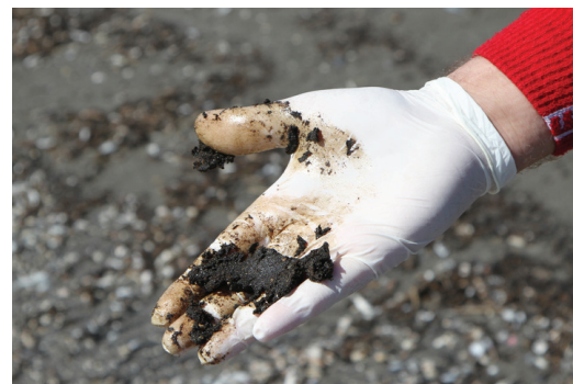
A close-up of tar, from BP's oil disaster, discovered Feb. 27, 2013 on Elmer's Island.

GRN will be watchdogging the various processes and spending mechanisms to ensure funds go towards effective, science-based restoration.