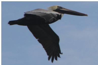
A brown pelican in flight.

Eventually, thanks to the creation of the Endangered Species Act, and the EPA's decision to ban DDT (a pesticide which was linked to weakened egg shells), the stage was set to re-import brown pelicans from Florida to breeding sites along Louisiana's coast. The species thrived! Finally, in November of 2009, the brown pelican was removed from the Endangered Species List. There is fear, however, that the bird will return to the list if more is not done to restore Louisiana's rapidly eroding coastal wetland.