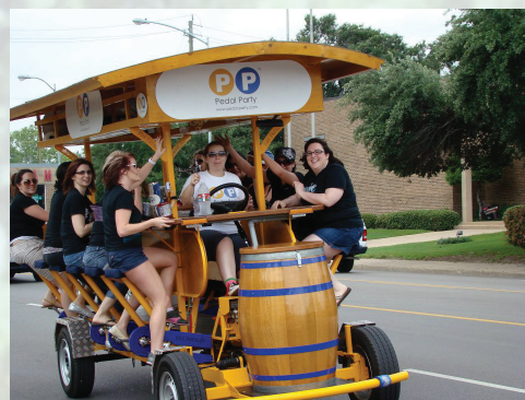
Pedal for Water in Houston, TX.