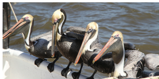
A hungry group of brown pelicans awaiting an easy meal aboard a shrimp boat.

Six months later, the BP oil disaster made the plight of Gulf pelicans front page news again. GRN's work to restore the Gulf aims to ensure permanent, healthy places for brown pelicans in the Gulf.