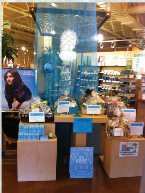
An Aveda/GRN outreach setup.

Once again we are truly excited to partner with AVEDA salons in Oklahoma, Arkansas and across the Gulf to raise funds for and awareness of GRN's Healthy Waters and BP Oil Disaster campaigns.