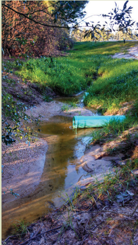
Sewage outfall near Little Tchefuncte River.

Like with many environmental issues, Gulf States languish behind other states in properly treating their sewage before discharging it into local rivers and streams. For several years, GRN has been working to ensure that municipal and private sewage treatment facilities properly treat their sewage before it goes into Gulf waters. Regretfully, many sewage facility operators are not adequately protecting their local streams.