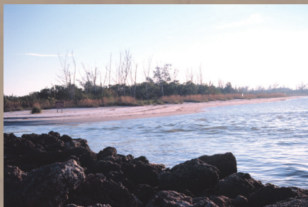
Florida coastal hardwoods dying from low freshwater flow and sea level rise.

Please join GRN as a Gulf Sustainer to help us fight for Florida's waters and wildlands in this legislative session. www.healthygulf.org/donate