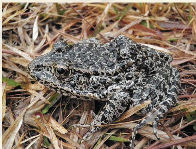
Roughly 100 dusky gopher frogs remain in the wild.

In June 2012, 11 years after listing and in response to litigation by the Center for Biological Diversity (CBD) and Friends of Mississippi Public Land, the USF&WS designated critical habitat in St. Tammany Parish, Louisiana (1544 acres) and in Harrison and Jackson County, Mississippi (4,933 acres). New Orleans attorney,