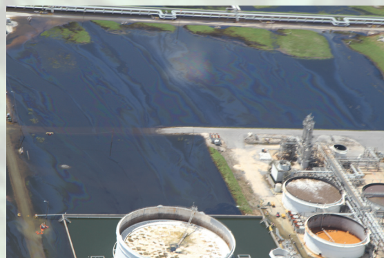
Shortly after Hurricane Isaac in August of 2012, GRN conducted flyovers revealing numerous leaks from oil, gas, and chemical facilities and infrastructure. Pictured is the Alliance refinery in Plaquemines Parish. Note the failed containment levee around the leaking storage tanks.

The BP drilling disaster highlighted the flawed process by which pollution discharges are reported and cleaned up, and through which polluters are held accountable. It revealed how the official channels of reporting and cleaning up pollution rely, to an inordinate degree, on the polluters themselves. Little information is made available to the public, and the information that is presented could be considered untrustworthy. GRN alone has filed over 50 reports of leaks with the National Response Center since 2010 and is pleased to be working with the Gulf Monitoring Consortium in the fight for a healthy Gulf.