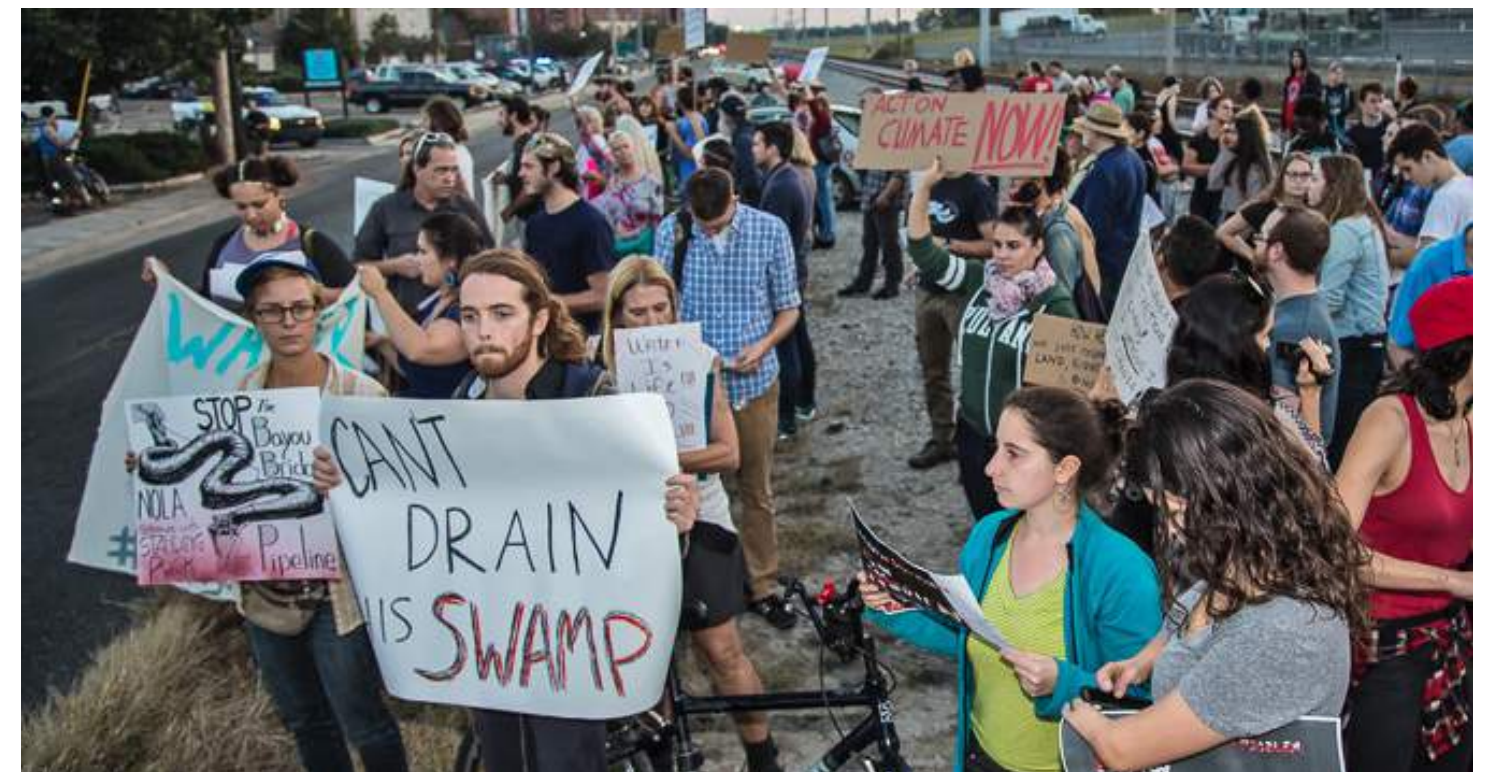
Protest in New Orleans, Part of a National Day of solidarity with the Standing Rock Sioux tribe in North Dakota.