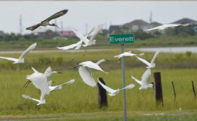
Ibis and Snowy egrets on Bolivar Island.

In 2008, Hurricane Ike devastated Galveston Island and caused significant damage to the Greater Houston area—especially coastal communities surrounding Galveston Bay and the Houston Ship Channel. Since that time, communities in and around Galveston have been thinking about how they will weather future, more intense storms.