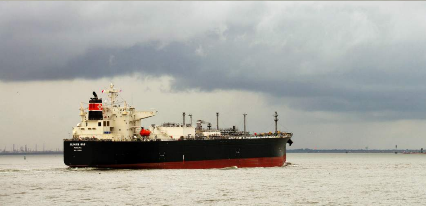
A tanker floats by in the proposed location of the Ike Dike.

It’s important to know what this project would mean for Galveston Bay and its surrounding communities. Until these questions are answered, it’s far too early to make decisions on what’s best.