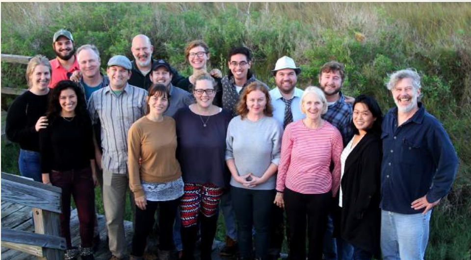
GRN staff recently visited the Louisiana University Marine Consortium (LUMCON) in Cocodrie, LA for their annual staff retreat.