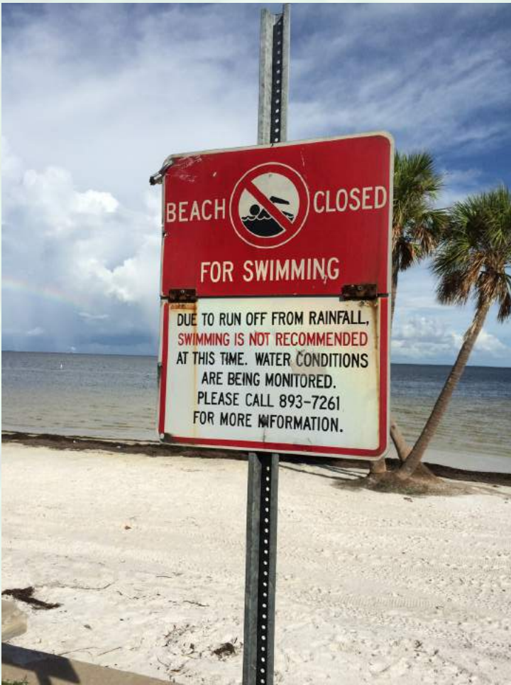
A closed beach due to sewage run off.

Based on our analysis, we recommended that there be public input and hearings before any negotiations between St. Petersburg and Florida Department of Environmental Protection were finalized. This sentiment was echoed by many members of the community and the City Council. Thanks to this public outcry, St. Petersburg is conducting at least two hearings to make sure public concerns are heard.