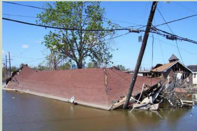
Flooding brought on during the August flood.

Climate change is coming to a coast near you. Rising seas and more severe storms are threatening the Gulf coast.