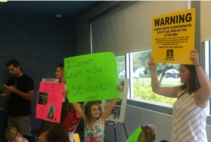
Florida residents hold up protest signs during a City Council hearing.

"THE ONLY REAL SOLUTION TO THE PROBLEM LIES IN MAJOR INFRASTRUCTURE IMPROVEMENTS THAT STOPS HARMFUL SEWAGE FROM POLLUTING OUR WATER."